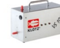
AIR SAMPLER FH5