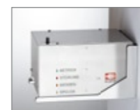
Option: Wall holder for PCSS air