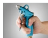
Particle counter for compressed air