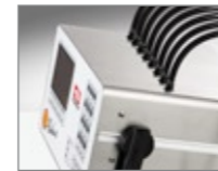
Abakus mobil air with 8-fold measuring point toggle