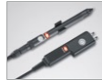
Nozzles: C, %rF, m/s pressure differential