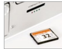
CF card memory