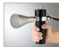
External sensors for the measuring range 5-500 µm