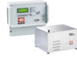
ABAKUS MOBIL AIR (Ama 5 28 / Ama 3 28 / Ama 2 28 / Ama 1 28)