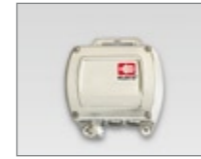
Network box for humidity and temperature sensors