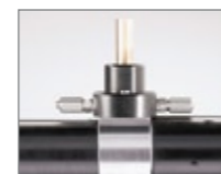
Sensor with air purge for dust measurements and filter test stands